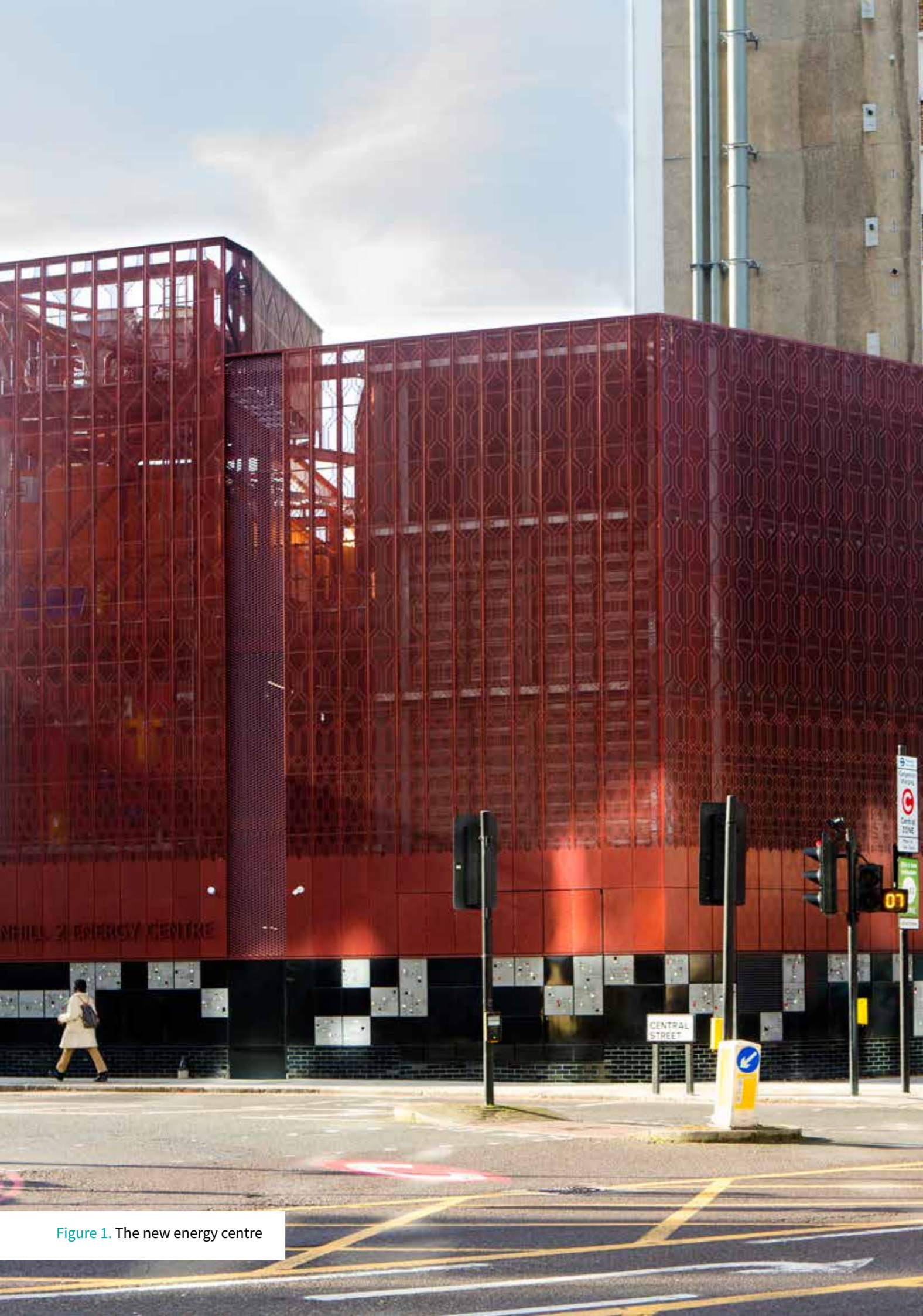
Figure 1. The new energy centre