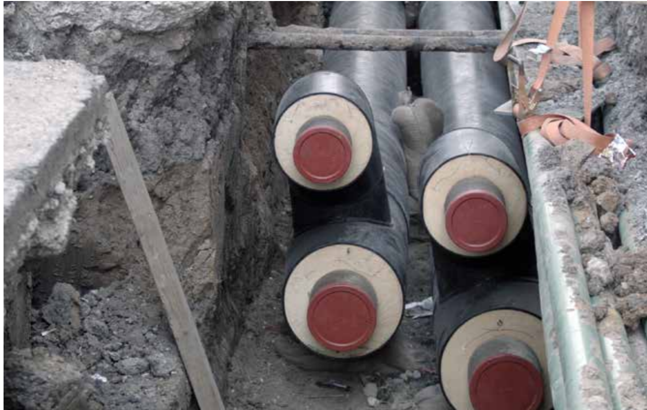
Figure 20. Insulated pipes