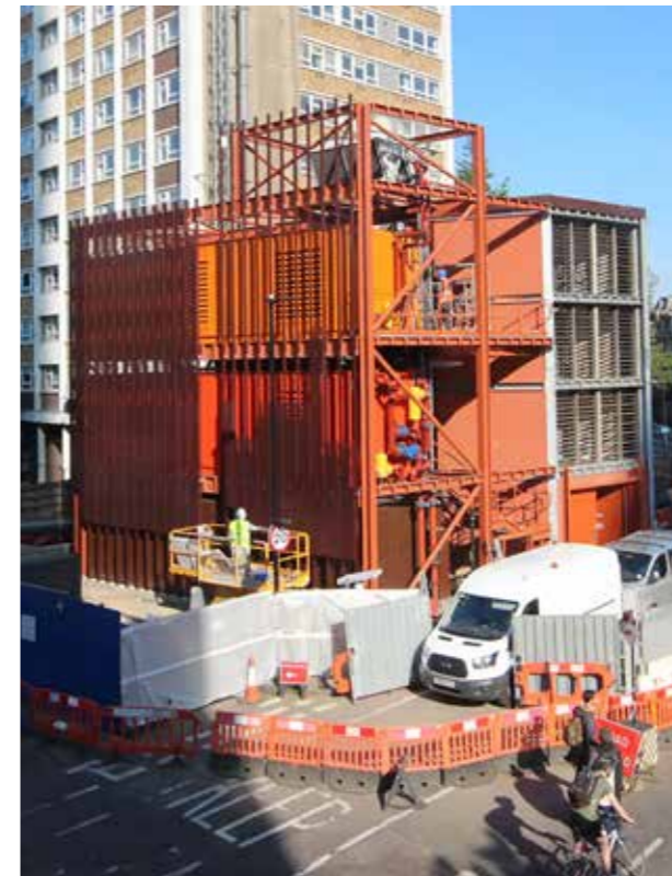
Figure 17. Starting the installation of façade panels