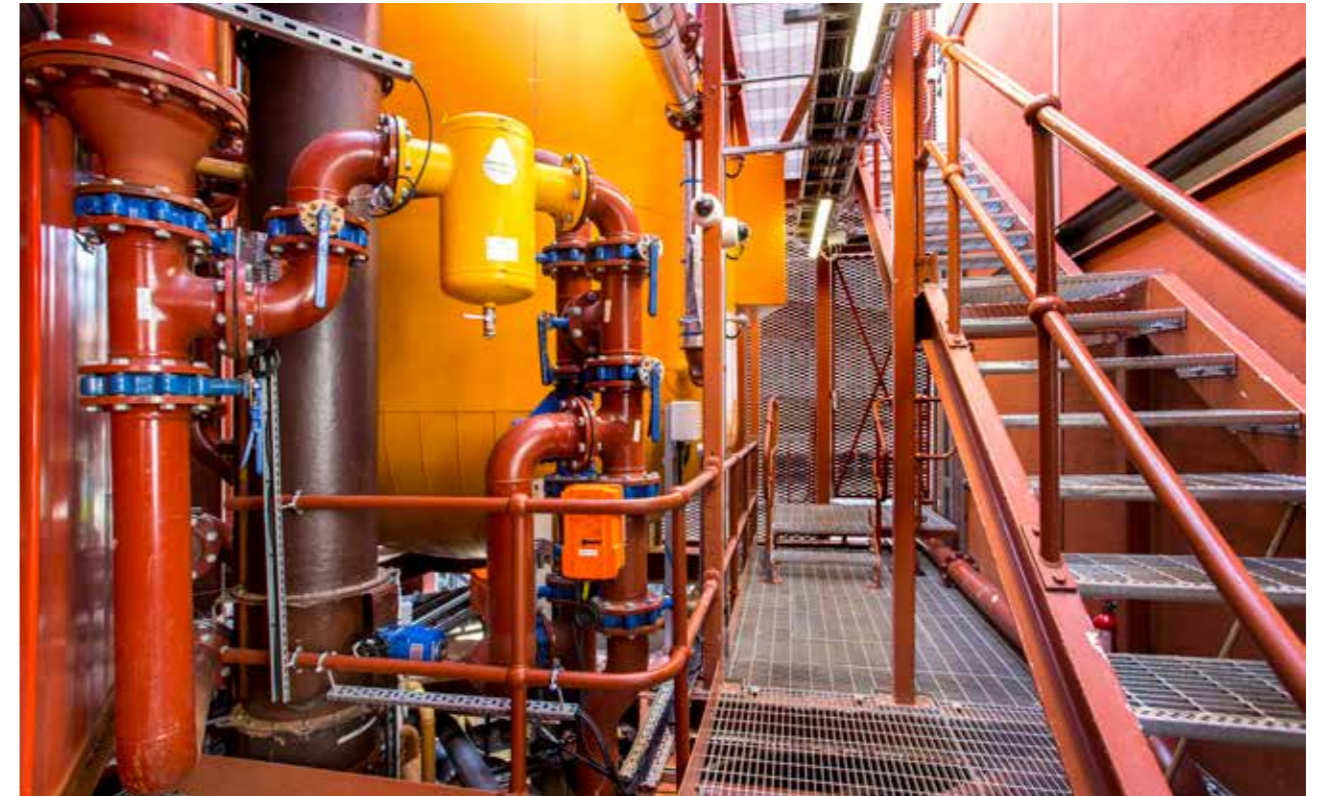
Figure 8. Thermal store in the new energy centre

Taking advantage of the properties of a refrigerant gas, the hot liquid in the heat pump passes through the water in the pipes and in doing so turns back into gas. The heat pump is then ready to be warmed up again by more warm air from the Tube. In addition, the fan in the ventilation shaft has the potential to be reversed in the summer to provide cooling to the Tube network, helping to make journeys more comfortable.