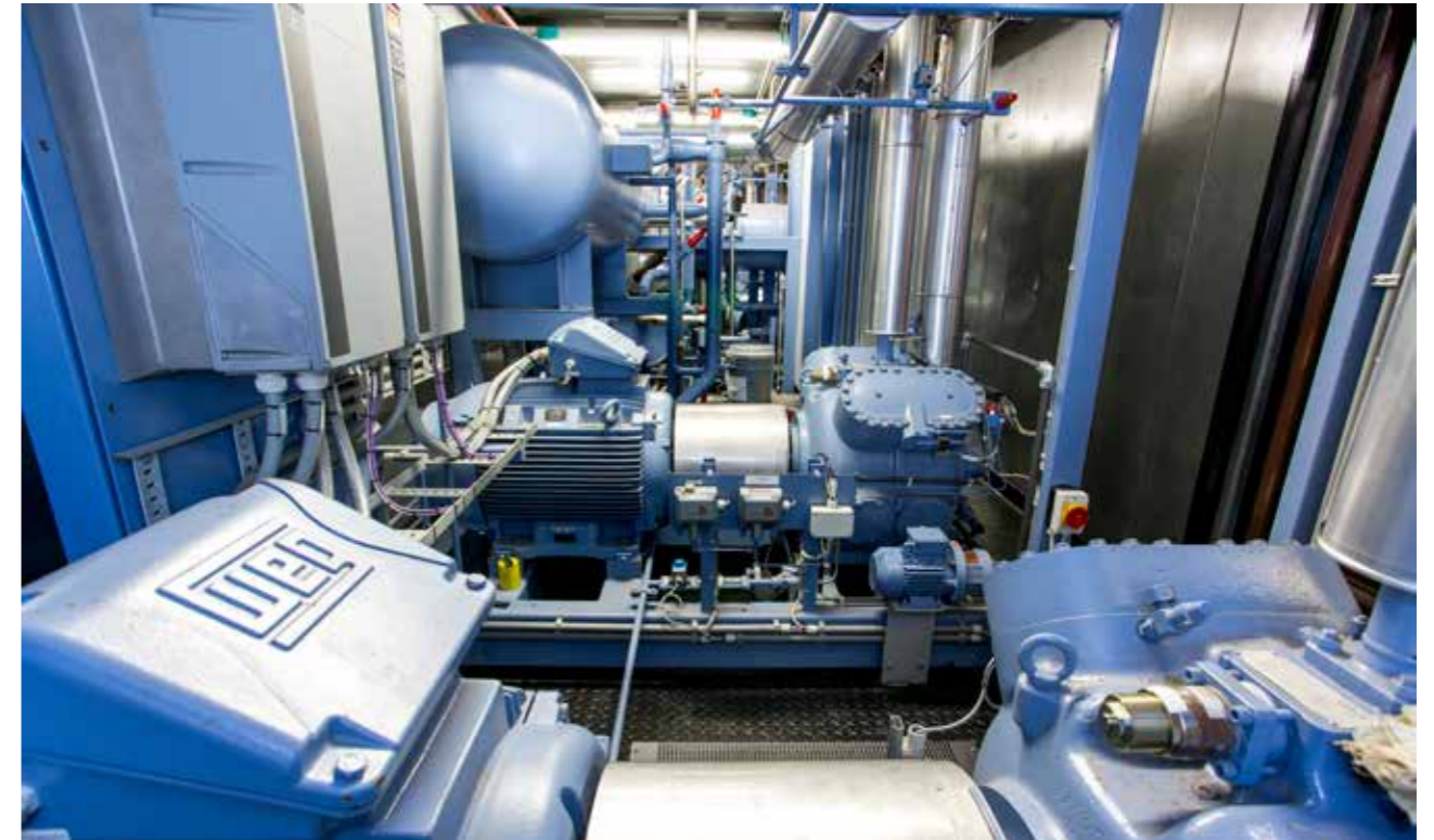
Figure 5. The heat pump in new energy centre