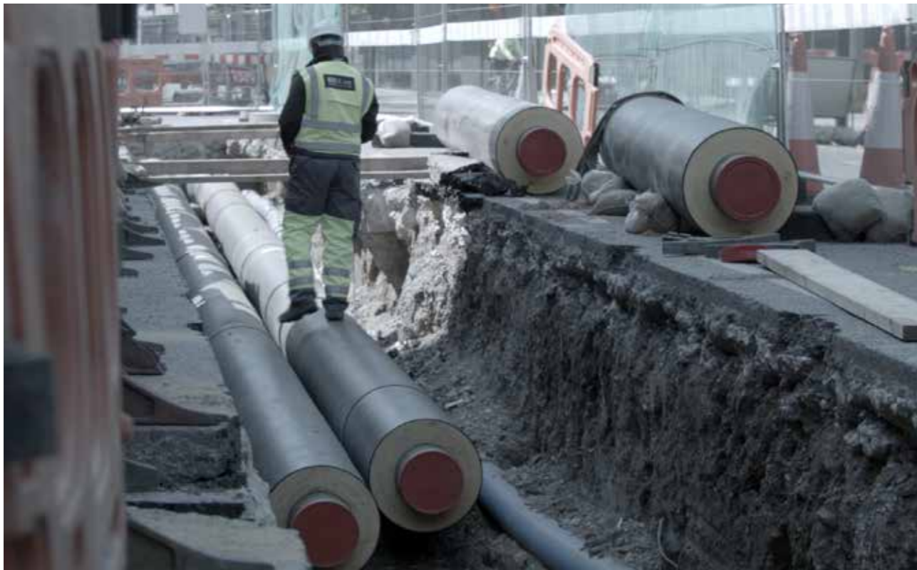
Figure 15. Laying the underground pipe network in Central Street