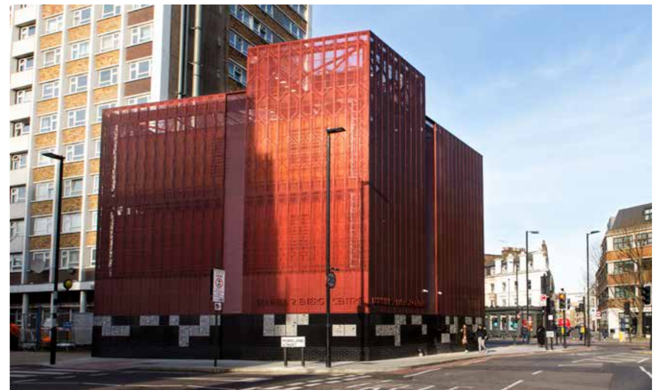
Figure 6. The new energy centre from Moreland Street