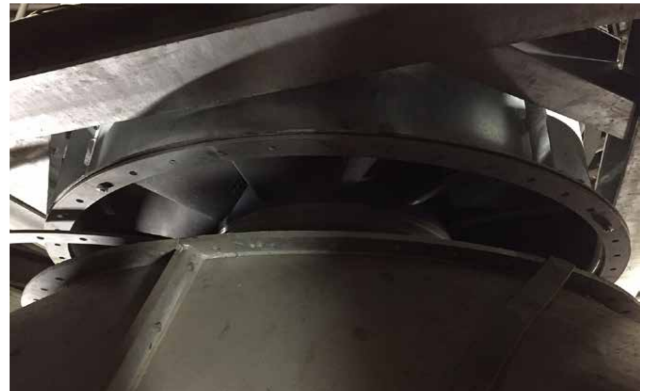
Figure 9. Ventilation shaft fan