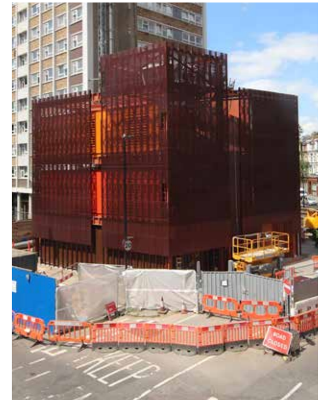
Figure 19. Completed installation of façade panels