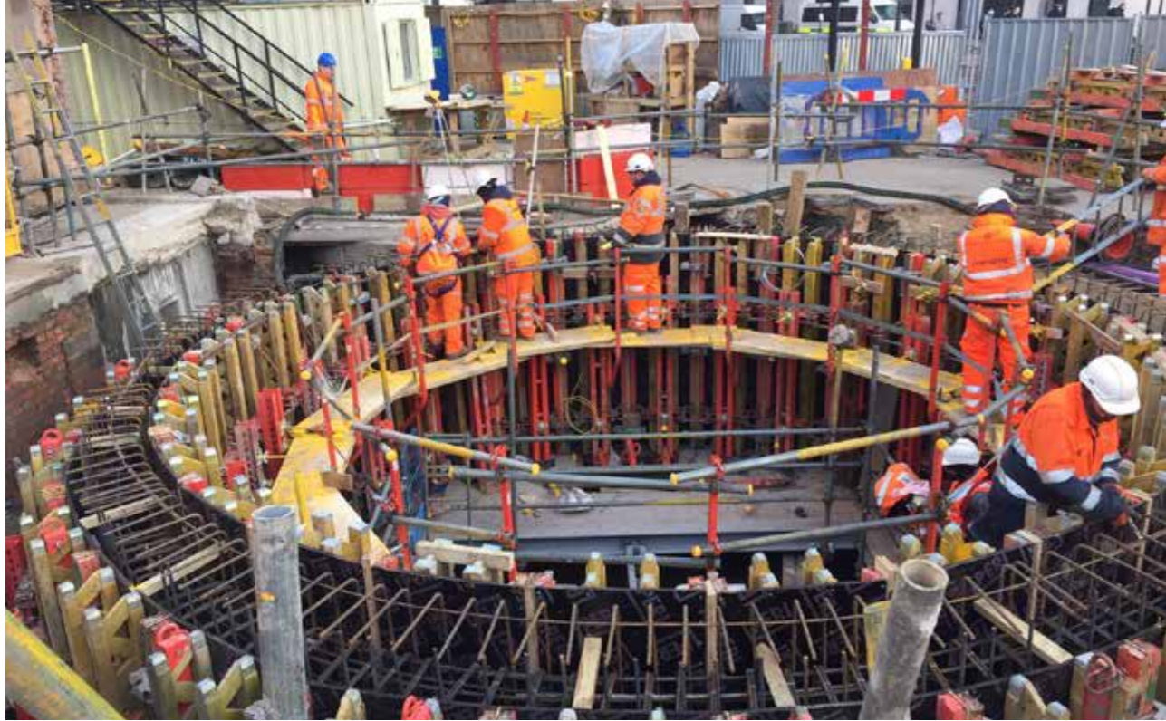
Figure 14. Laying foundations