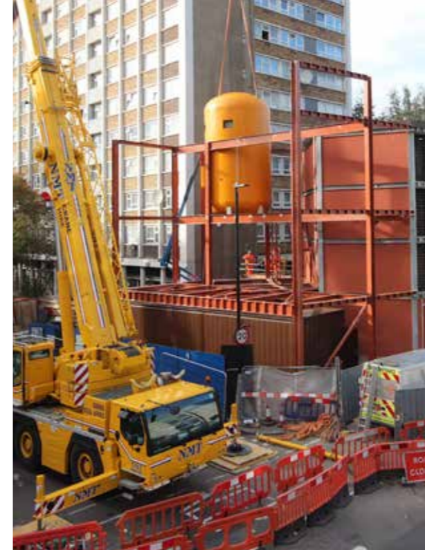
Figure 16. Craning thermal store into the new energy centre