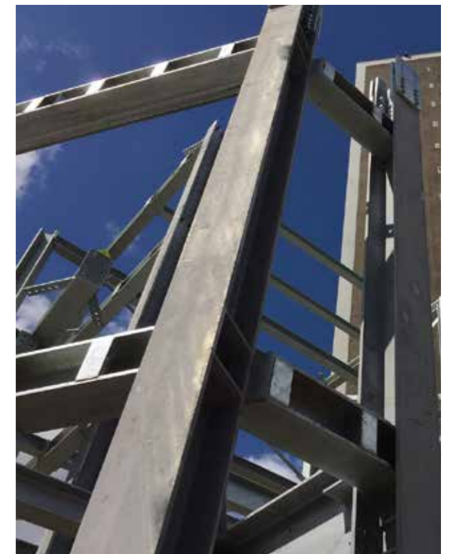
Figure 13. Ventilation shaft steel frame