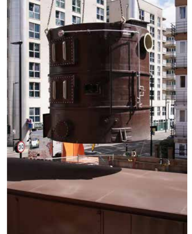
Figure 18. Installing the carbon scrubber