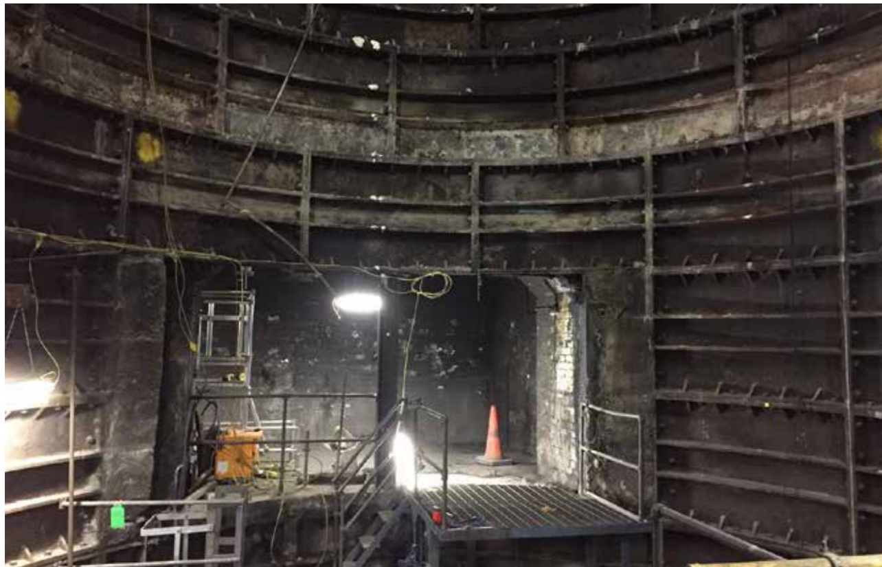
Figure 21. Inside the ventilation shaft